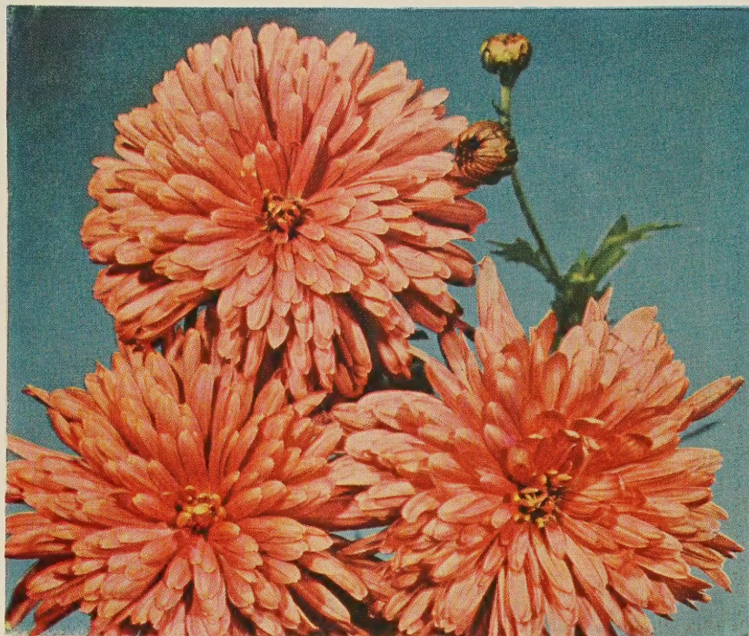
TRIBUTE. 60c each; 3 for $1.50